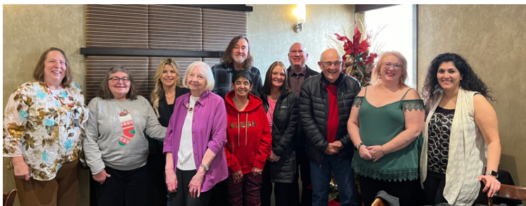
Partnership Speakers and special guests.